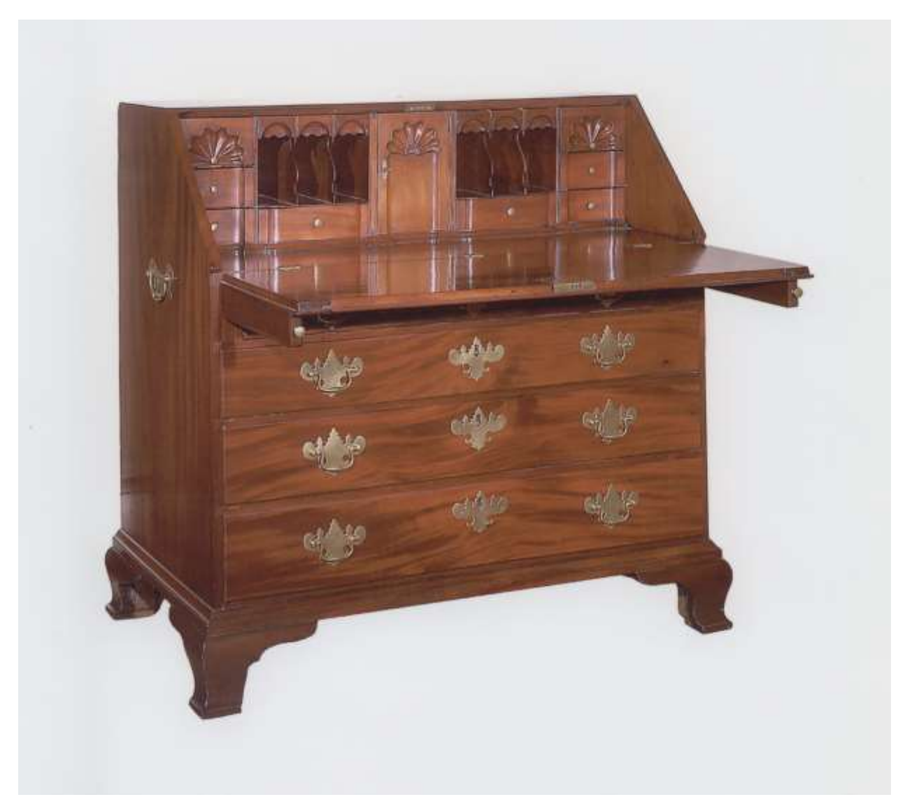
Figure 1. Newport desk bearing the inscription S. Goddard , mahogany, 42"h, 39"w, 23"d, private collection.

The recent discovery of an S. Goddard inscription in a Newport desk (fig. 1) holds a significance that exceeds the rarity of the inscription. Few examples of Newport furniture bear signatures, and fewer bear the name of a member of the Goddard family. Beyond that, the presence, position, and orientation of the inscription offer insight into Newport family shop practices. This example suggests that Newport pieces are often the product of many hands, which is perhaps a reason why the work of some Newport shops was often unsigned by a single individual.